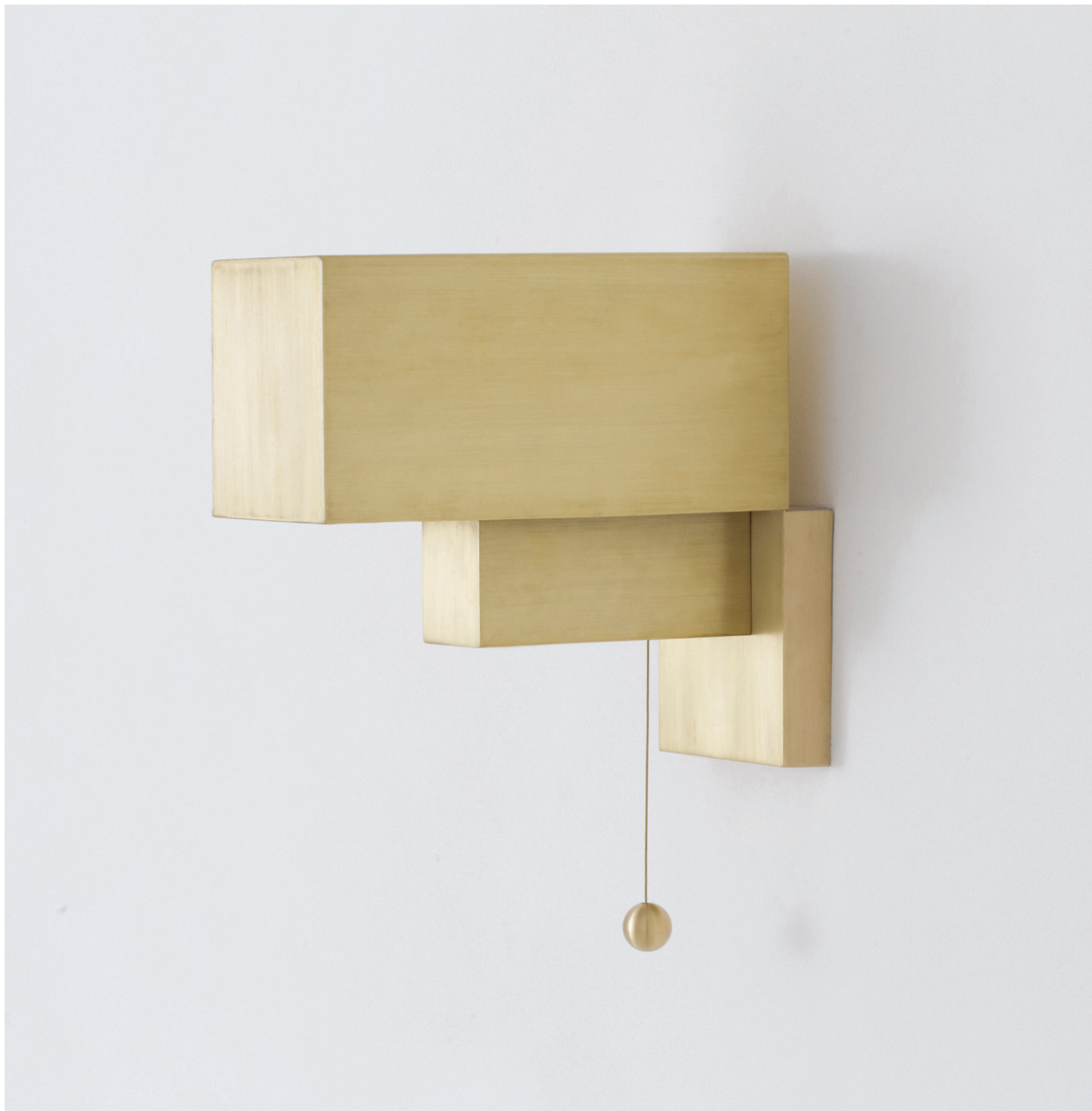
BLOCK SCONCE hewn brass