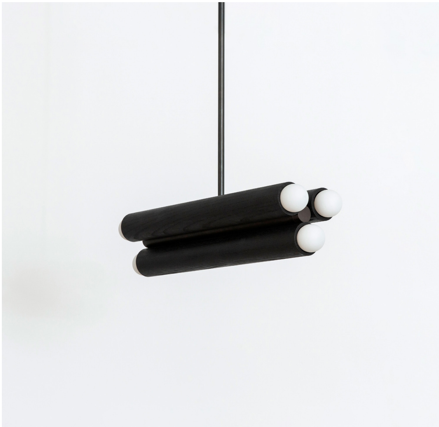
BEAM PENDANT LARGE oxidized oak