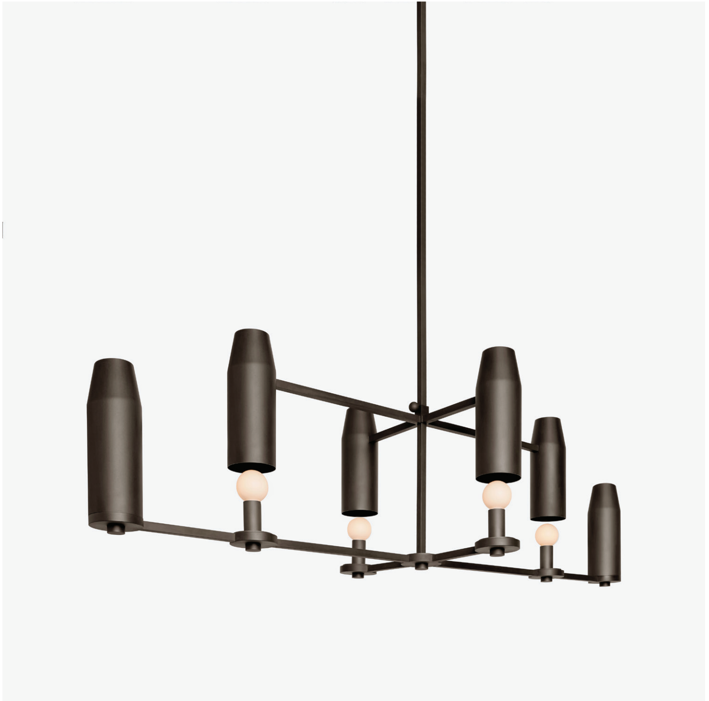
CHAMBER CHANDELIER hand finished bronze