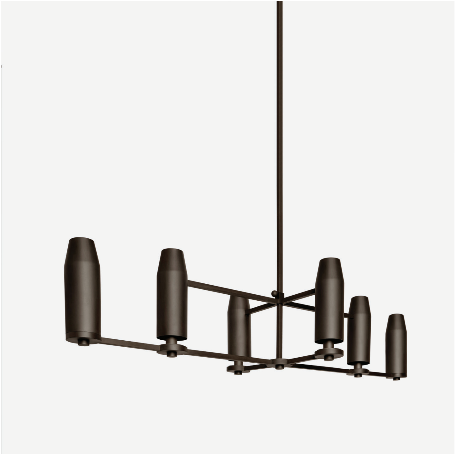
CHAMBER CHANDELIER hand finished bronze