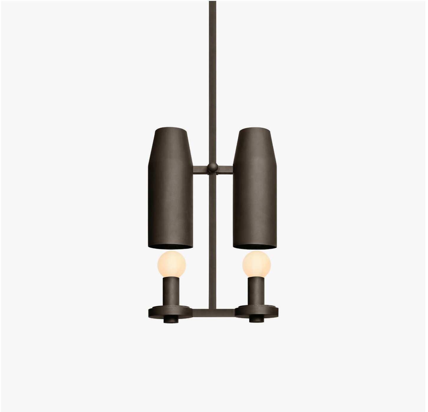
CHAMBER PENDANT II hand finished bronze