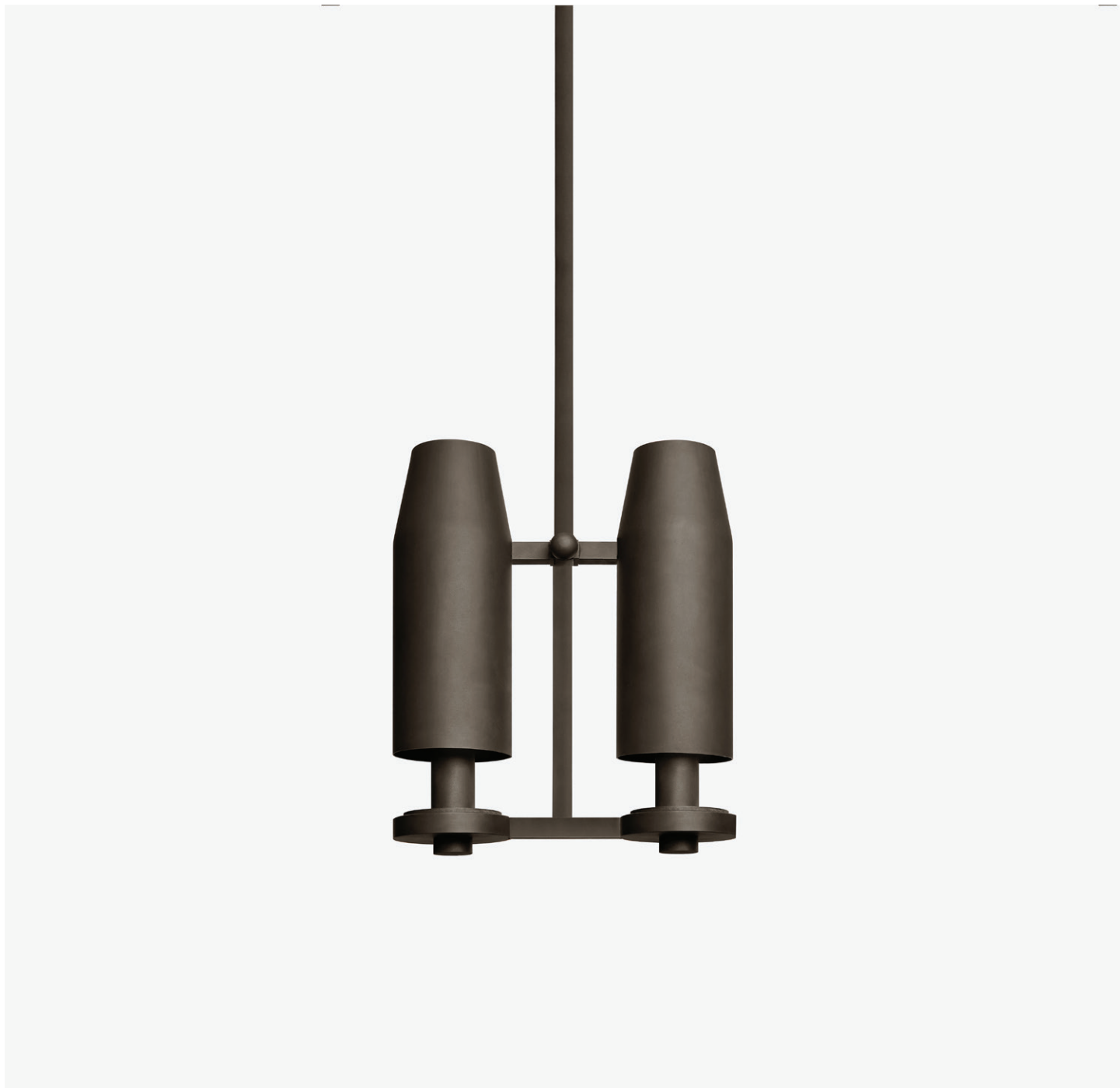
CHAMBER PENDANT II hand finished bronze