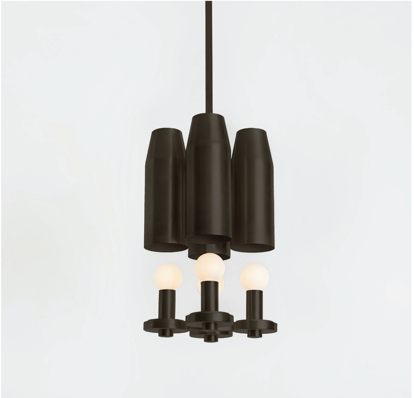
CHAMBER PENDANT IV hand finished bronze