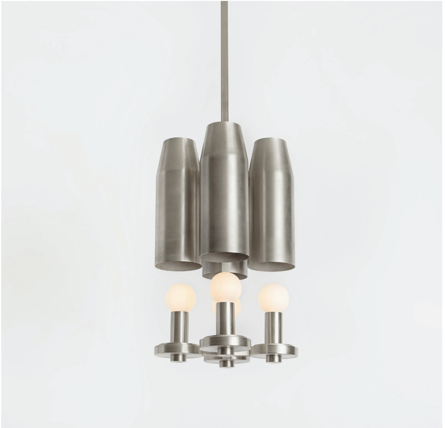
CHAMBER PENDANT IV brushed nickel