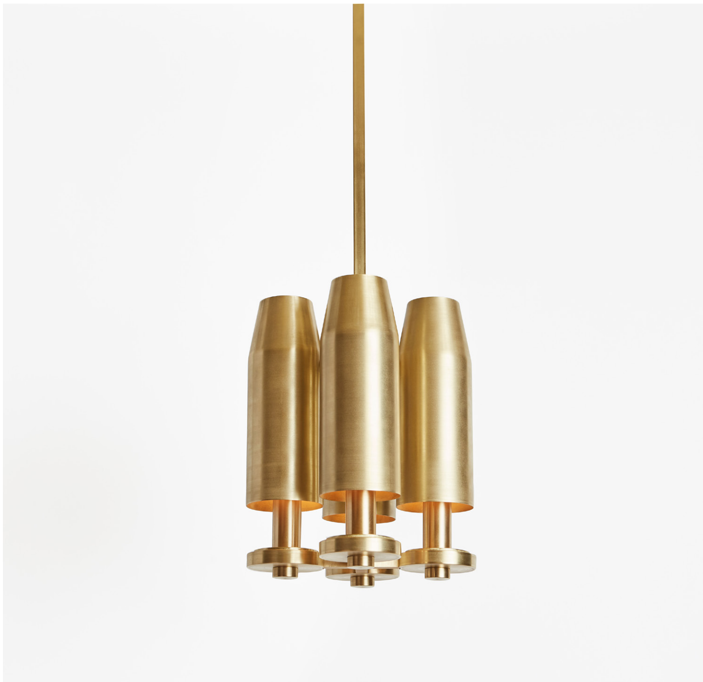
CHAMBER PENDANT IV hewn brass