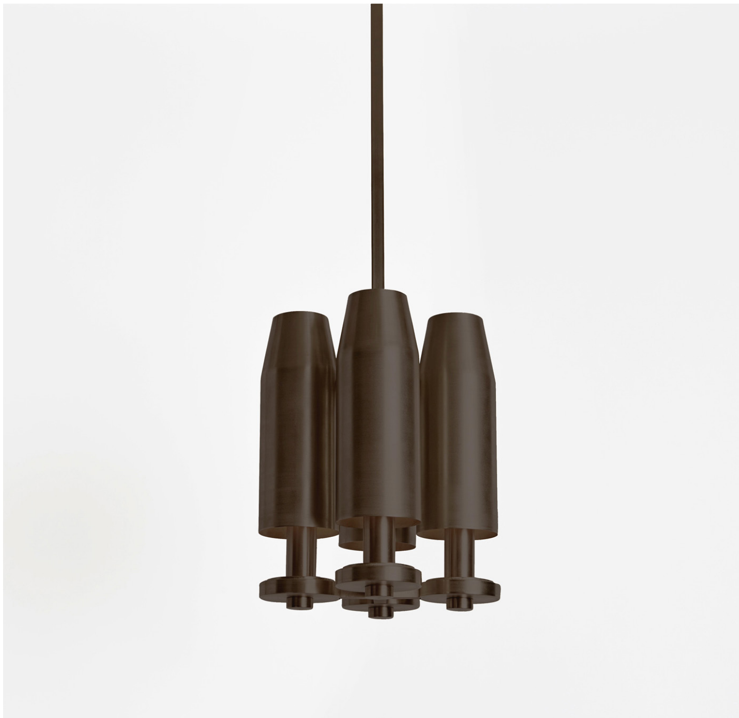
CHAMBER PENDANT IV hand finished bronze