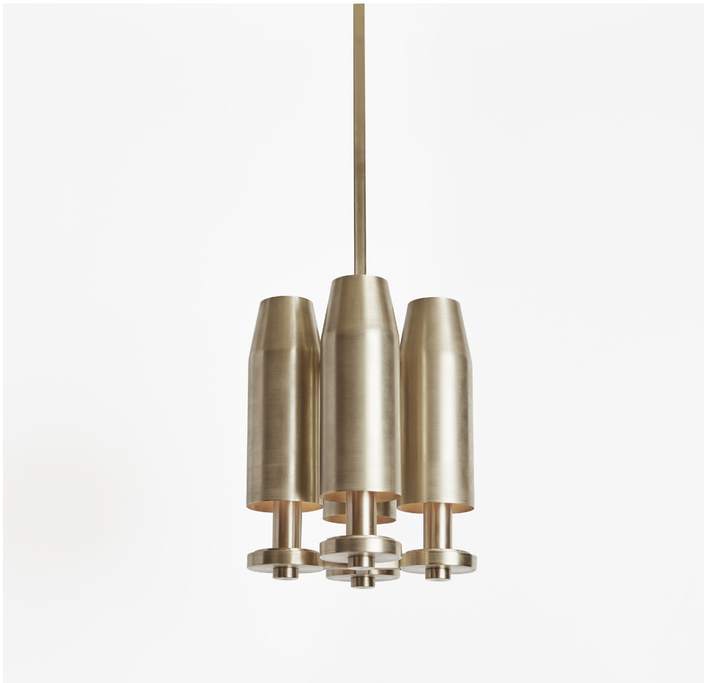
CHAMBER PENDANT IV brushed nickel